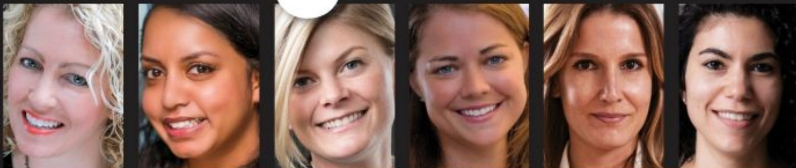
BOUTIQUE DESIGN'S 2019 BOUTIQUE 18