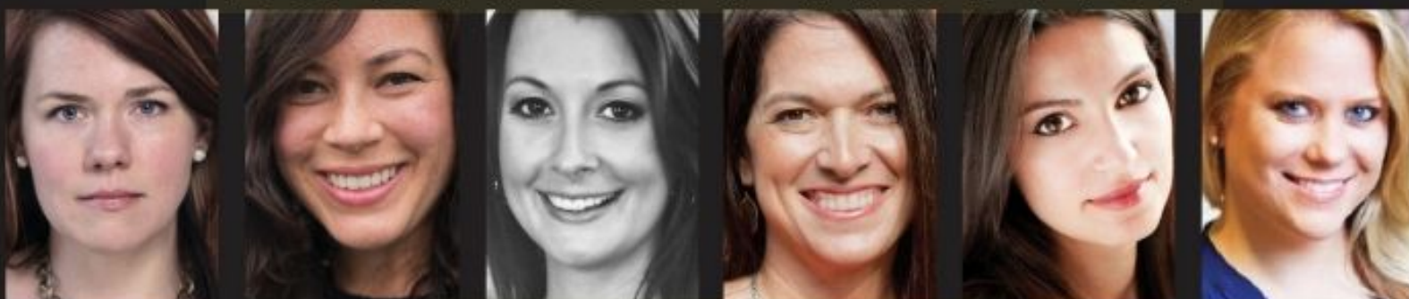
BOUTIQUE DESIGN'S 2019 UP-AND-COMING HOTELIERS