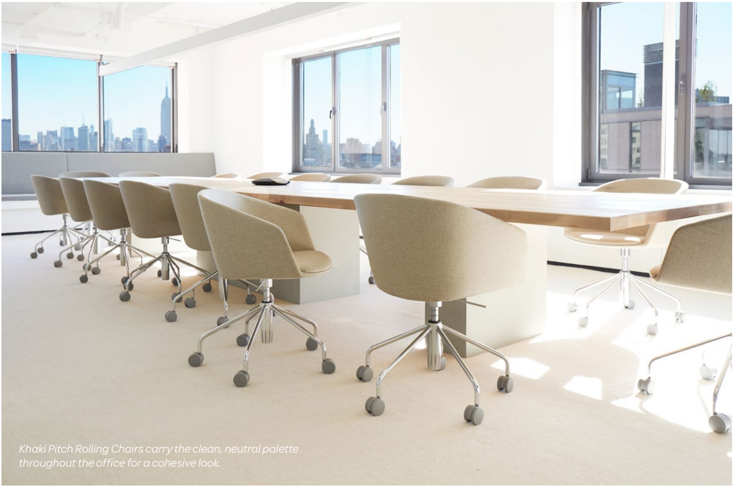
Khaki Pitch Rolling Chairs carry the clean, neutral palette throughout the office for a cohesive look.