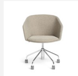
Pitch Rolling Chair