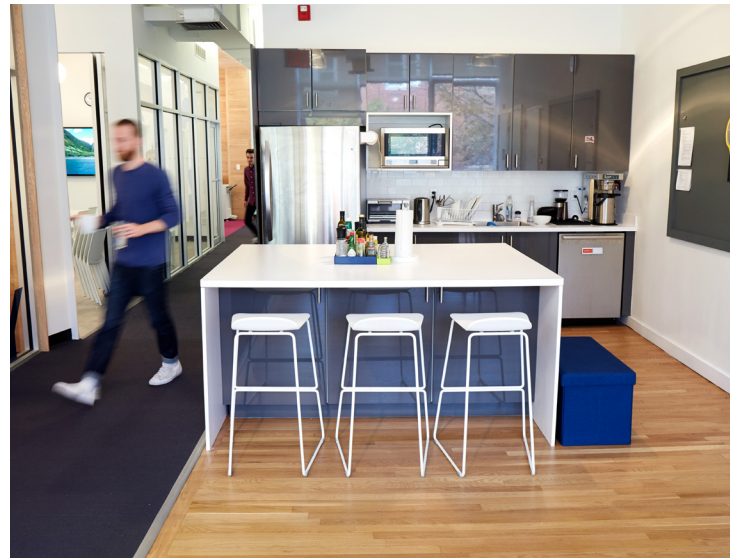
Upbeat Stools work double duty as a lunch bar or ergonomic standing work zone.