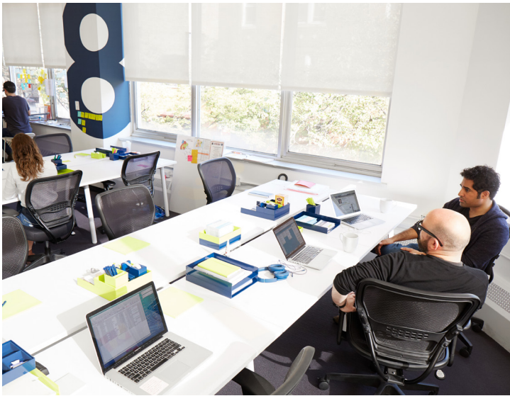
Rows of open Series A Desks allow for office-wide communication and collaboration.