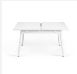
Series A Double Desk