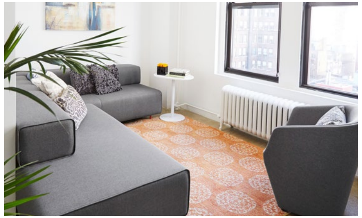
The Block Party Lounge Corner Office and Pitch Club Chair combine to create a relaxing space for group brainstorm.