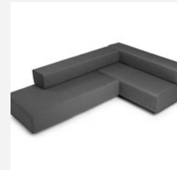
Block Party Lounge