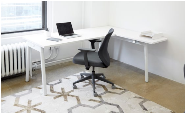
The L-shape Series A Desk System is perfect for executives who need extra space to get work done.