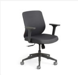
Max Task Chair

See how the Poppin Furniture Collection can work for you.