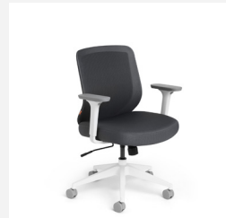
Max Task Chair