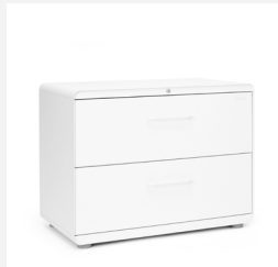
Stow Lateral File Cabinet