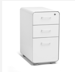
Slim Stow File Cabinet