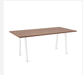
Series A 72" Conference Table