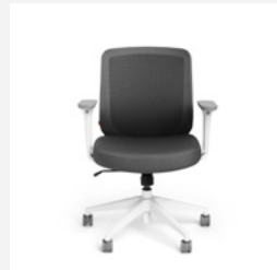
Max Task Chair