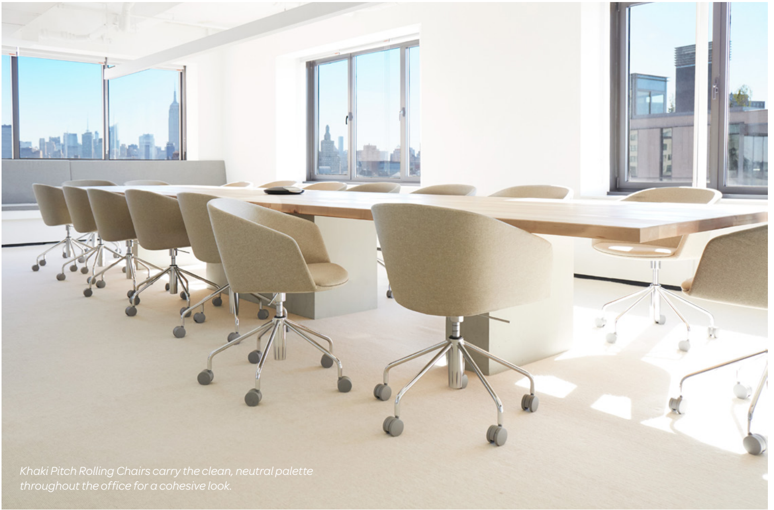
Khaki Pitch Rolling Chairs carry the clean, neutral palette throughout the office for a cohesive look.