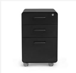
Stow File Cabinet

See how the Poppin Furniture Collection can work for you.