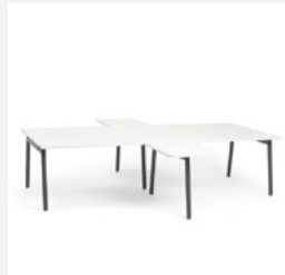
Series A Double Desk