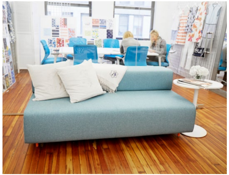
Paired with a Draper James pillow and throw, our Block Party Sofa creates cozy, on-brand seating outside the conference room.