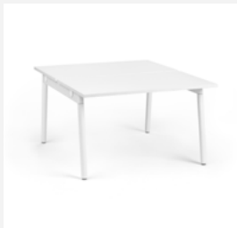
Series A Double Desk

See how the Poppin Furniture Collection can work for you.