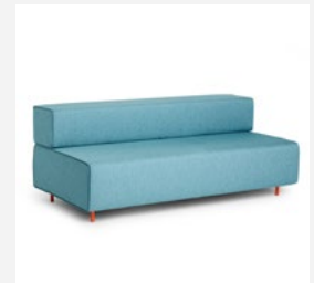
Block Party Lounge