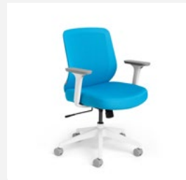
Max Task Chair