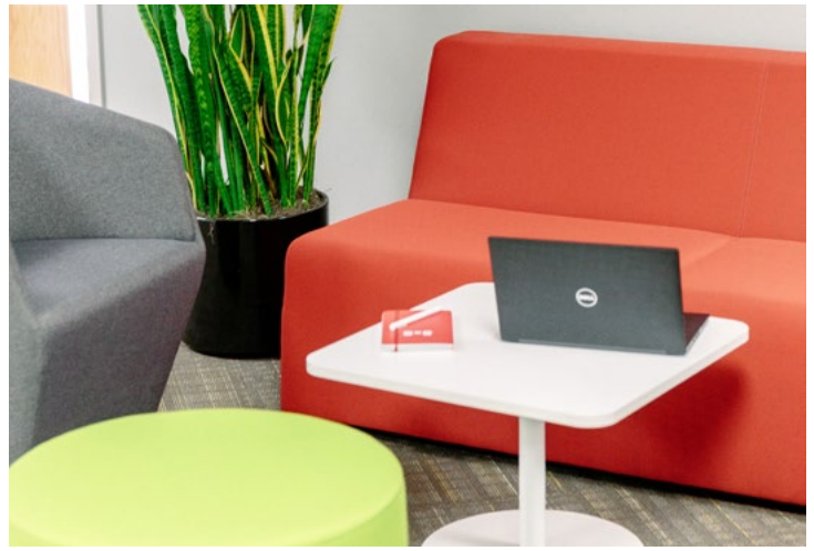
Mix + match your brand colors with neutral hues to create a calm and inspiring space.