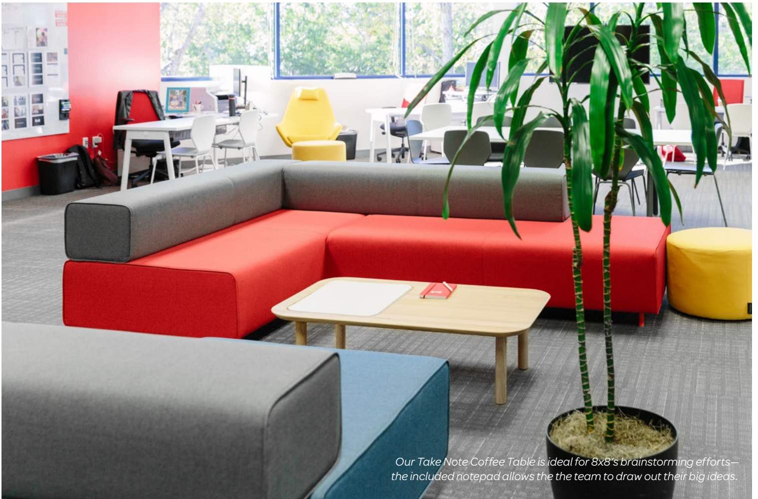
Our Take Note Coffee Table is ideal for 8x8's brainstorming efforts—the included notepad allows the the team to draw out their big ideas.