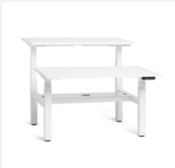
Series L Adjustable Height Double Desk for 2

See how the Poppin Furniture Collection can work for you.