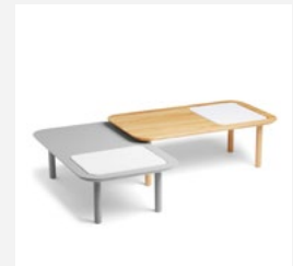
Take Note Coffee Table