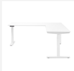
Series L Adjustable Height Corner Desk