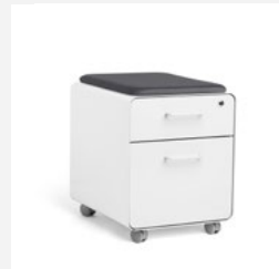
Mini Stow File Cabinet