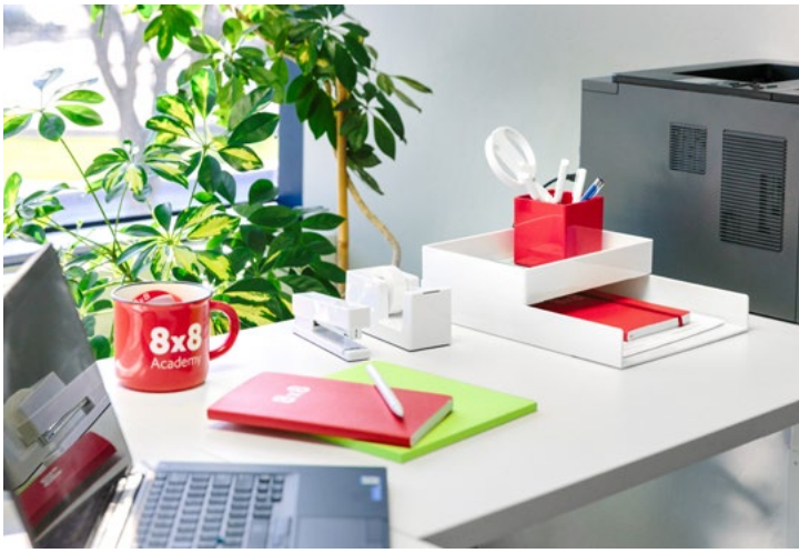
Customized Poppin notebooks extend 8x8's brand story onto the desktop and into the world.