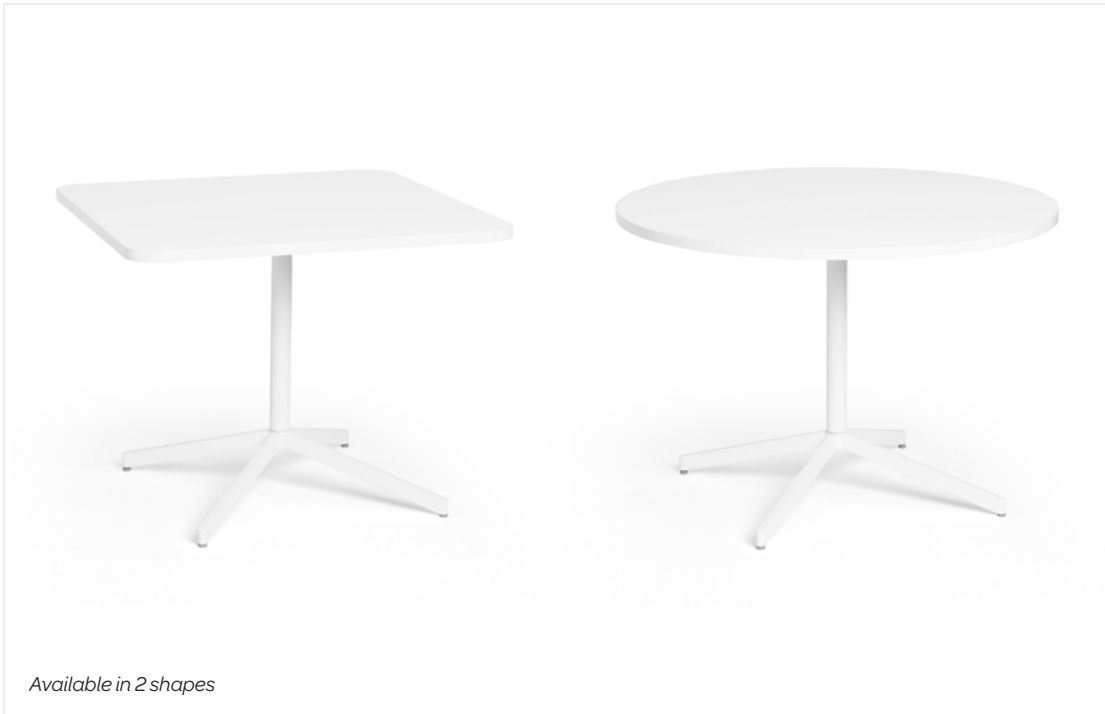
Available in 2 shapes