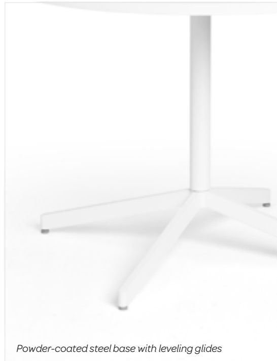
Powder-coated steel base with leveling glides