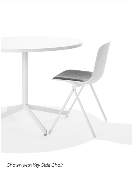
Shown with Key Side Chair