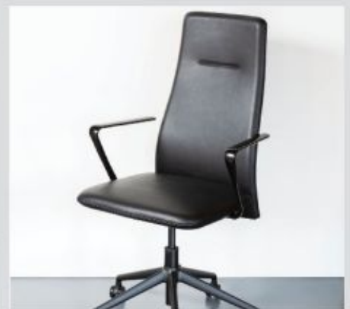
HBF: Vela Swivel Chair hbf.com

Inspired by the fluidity and formlessness of water droplets, this 17-inch-high desk lamp can be posed in a virtually limitless numbers of ways.