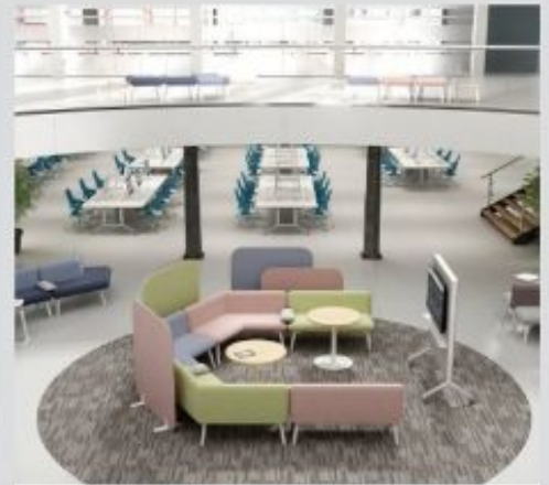
Boss Design: Myriad Modular Furniture bossdesign.com

This new writable work surface divides space in collaborative environments and is available with a magnetic, fabric, flintwood, or laminated back.