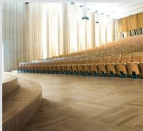
Gerflor USA: Saga² Tiles gerflorusa.com

This versatile range of upholstered modular furniture comes complete with eleven linkable seating units, three privacy screens, side tables, and arms that accommodate power.