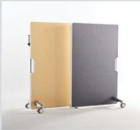
Teknion: Thesis Mobile Markerboard teknion.com

This nesting chair offers 14 degrees of flex at the hip and built-in ergonomics allowing for easy movement.