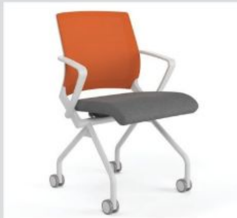
SitOnIt: Movi Chair sitonit.net