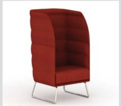
Koleksiyon: Throni Chair koleksiyoninternational.com

The future of education calls for flexibility, technological integration, and products that accommodate both solitary work and collaboration. From a mobile marker board that also serves as a space divider to a playful bench that provides convenient storage, here are our picks of new products to help make ever-evolving learning spaces more productive.