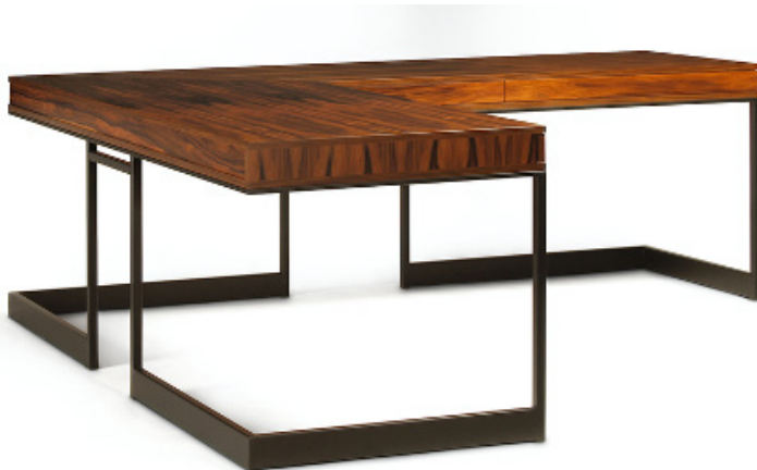
Skram Furniture: Wishbone Executive Desk

>Skram Furniture launched the Wishbone Executive Desk, a new addition to its Wishbone Collection. Fully-customizable, the new desk features a large-scale ‘L’ shape, incorporating the Wishbone aesthetic of daring cantilever and streamlined proportions. It includes a clear span on the ‘user’ side for unobstructed movement, concealed power/data and wire management options, integrated keyboard pull-out drawer, and access to the full complement of Skram’s material selections for both the woodwork and the metalwork. Options for customization include material, scale, and configuration. Read More