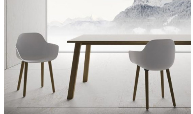
LEVEL 4 DESIGNS: Pola Round

>LEVEL 4 DESIGNS introduced the Pola Round Collection by LC Studio. This new design is an extension of the company's successful Pola Collection. Pola Round offers clean, simple lines and a variety of design elements for both indoor and outdoor applications. The standard design incorporates a polypropylene shell upper with a variety of base options in both