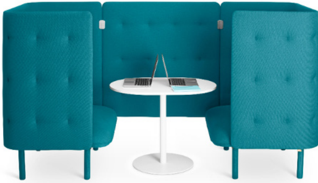
Poppin: QT Chair Booth

work, the The QT Chair Booth can be used as a private niche, a space divider, or a small “conference room” for intimate meetings. It was developed to block distractions, encourage uninterrupted focus, and provide turnkey private space for two-person meetings. The chair responds to the increasing demand for flexibility in the workplace—it can serve as a space for interviews, a private escape in the midst of an open floor plan, or a comfortable resting place in the break room. Read More