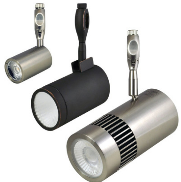
Nora: Cyndi Rail LED