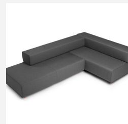
Block Party Lounge