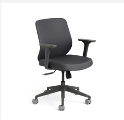
Max Task Chair

See how the Poppin Furniture Collection can work for you.