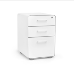
Stow File Cabinet

See how the Poppin Furniture Collection can work for you.