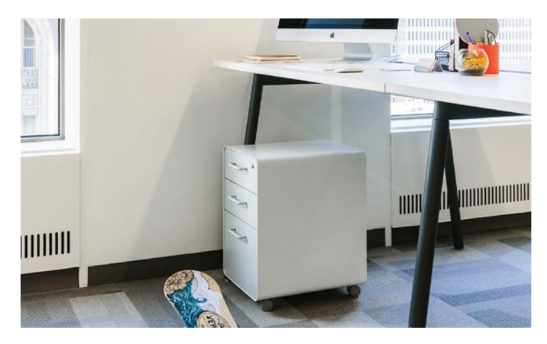
Stow File Cabinets in White provide minimalist personal storage to keep desks clutter-free.