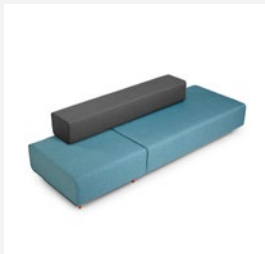
Block Party Lounge

See how the Poppin Furniture Collection can work for you.