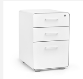
Stow File Cabinets