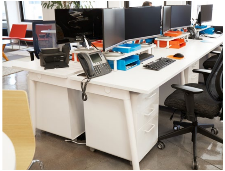
A pod of Series A Desks provides a benching solution that fits in with the modern, culture-forward look of DOAR's new space.