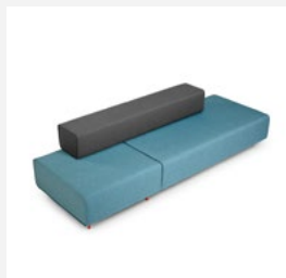
Block Party Lounge

See how the Poppin Furniture Collection can work for you.