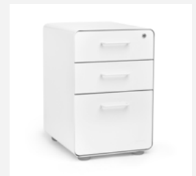
Stow File Cabinets