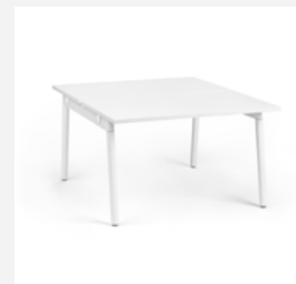
Series A Desks