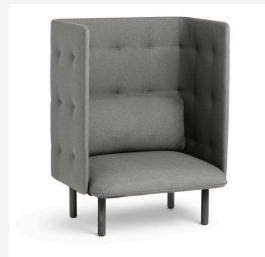
QT Lounge Chairs