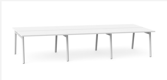
Series A Double Desks

See how the Poppin Furniture Collection can work for you.