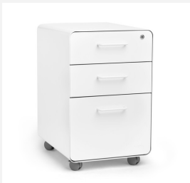
Stow File Cabinet