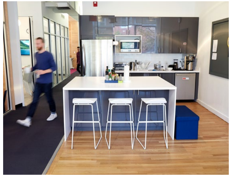
Upbeat Stools work double duty as a lunch bar or ergonomic standing work zone.