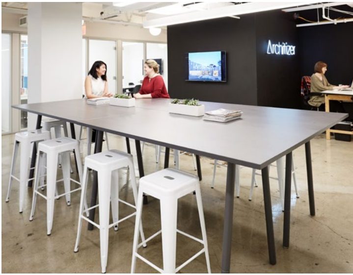
Max Task Chairs allow the team to create an event space in seconds.