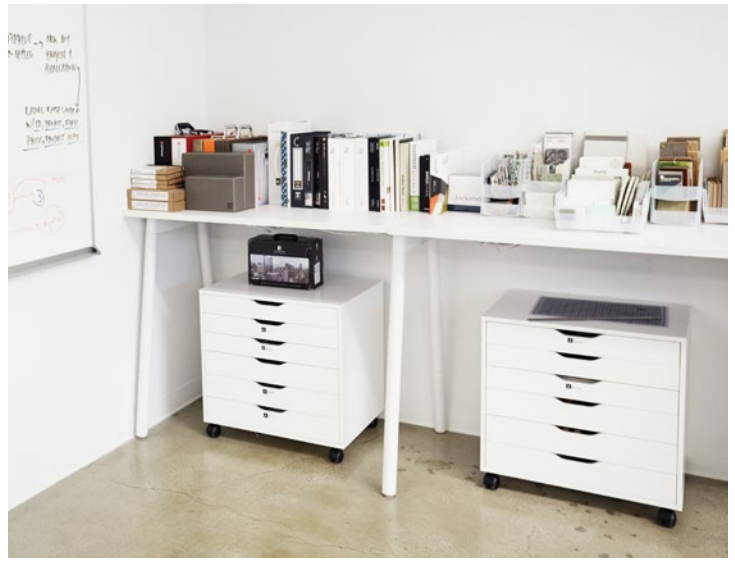
Max's ergonomic details work for both long-term and short-term seating.